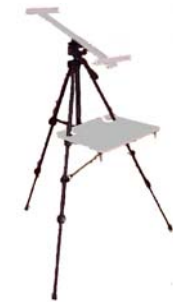
Lite-Weight Painters Startup Package Item 20-40