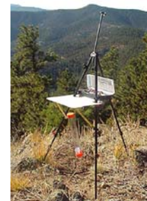
Oil Painters Startup Package Item 20-24