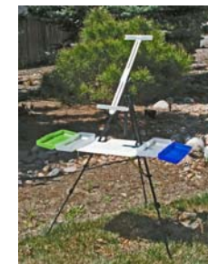
Pastel Painters Starter Package Item 20-34