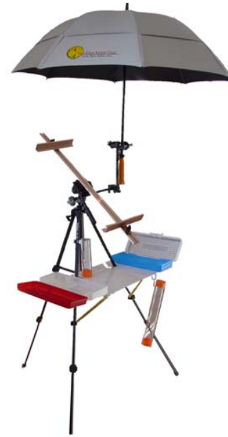
SunEden Tripod with Traveling Adapter, Artists Shelf, two Side-Mount Accessory Boxes and the Traveling ArtBrella Package.