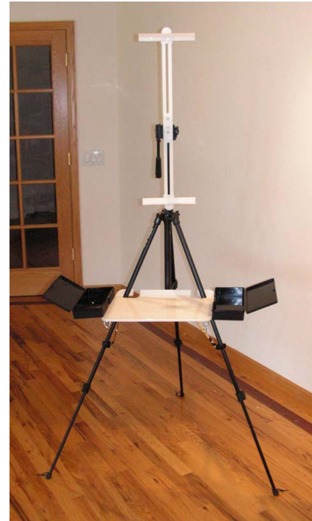
SunEden Tripod (03-01, Traveling Adapter (02-04), Artists Shelf (01-20), and two Side-Mount Accessory Boxes (01-12)