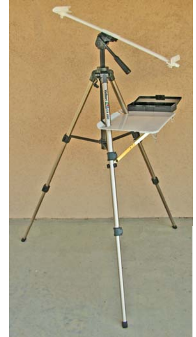
SunEden Heavy-Duty Plein Air Tripod with Traveling Adapter, Artists Shelf and Side-Mount Accessory Boxes.