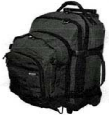
13-06. Rolling Art BackPac

13-01. Artist's StudioPac. Your studio in a backpack! Flatwork Compartment features dual zipper flip top which allows access to 19"x24" pads, canvases, etc. Dual zippered center compartment carries supply boxes and so much more! Twin outer compartments hold your SunEden Tripod or Easel, Tilting Adapter and Roll-A-Stool or Chair. Waterproof coated fabrics minimize bulk. Tough and indispensable for the artist on the move. Features adjustable shoulder straps to provide comfortable fit for every artist. Weighs 3.6 lbs.